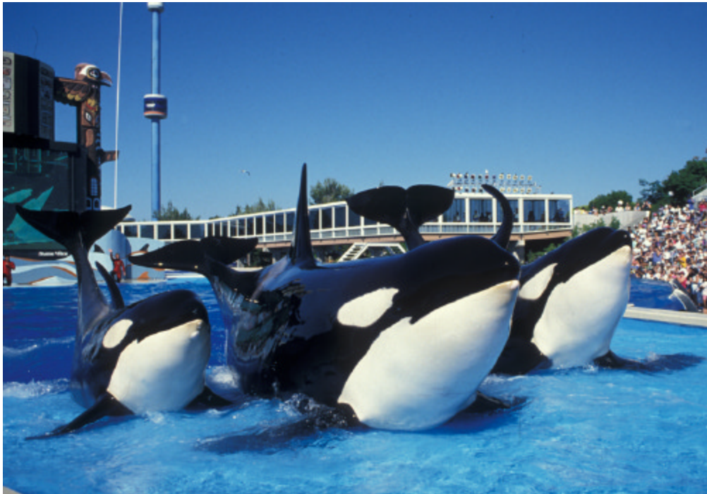
Shamu Stadium is one of the largest marine animal pool in the world.