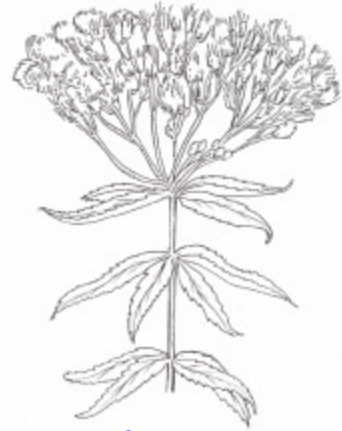
Joe Pye weed

This plant is named after a native American who cured typhus fever with an extract from the roots.