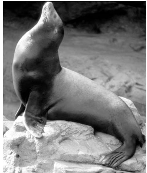
California sea lions ( Zalophus californianus ) have small external ear flaps and winglike front flippers.