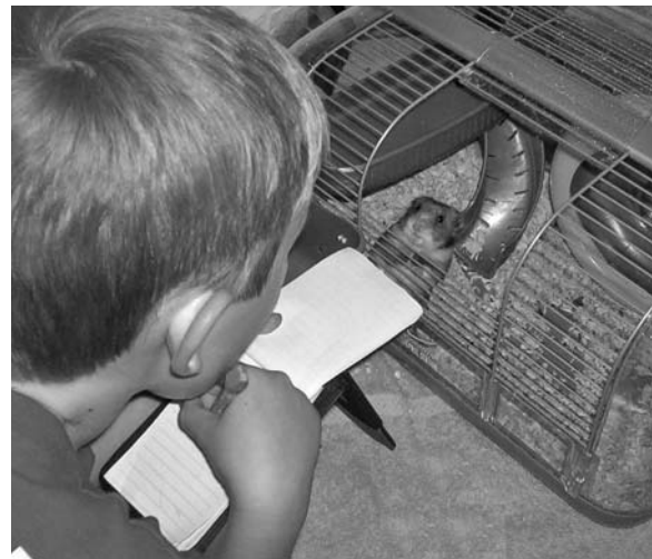
Students observe animal behavior at SeaWorld ( left ) and in the classroom ( right ).